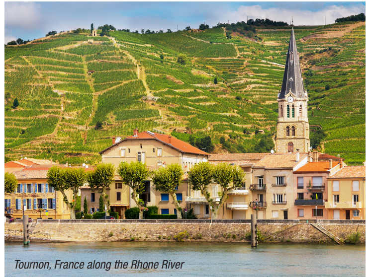
Tournon, France along the Rhone River

Cruise through France along the Rhône and Saône Rivers with guided sightseeing to see French treasures and hidden gems. Take in the beautiful countryside, quaint villages and towns, with captivating views of France. First port of call is Lyon, France's gastronomic capital, founded by the Romans in 43 BC, and a showcase of medieval and Renaissance architecture. Visit the popular Place des Terreaux with its lively cafés, fountains and monuments. Be sure to sample Beaujolais, the famous wine of the region. Beautifully nestled among vineyards, you'll next find the city of Tournon, a medieval treasure with plenty of Roman ruins and a fascinating 16th-century castle, where you'll take a guided walk. Continue your river cruise to historical Avignon to see the 14th-century Palace of the Popes, the largest gothic fortress in the world. On the Rhône River sits Arles, France—famous for inspiring the paintings of Van Gogh and for its 1st-century Roman Amphitheater, which hosts plays and concerts to this day. Take advantage of your free time to stop in Le Café van Gogh to see the surroundings as the famous artist did.