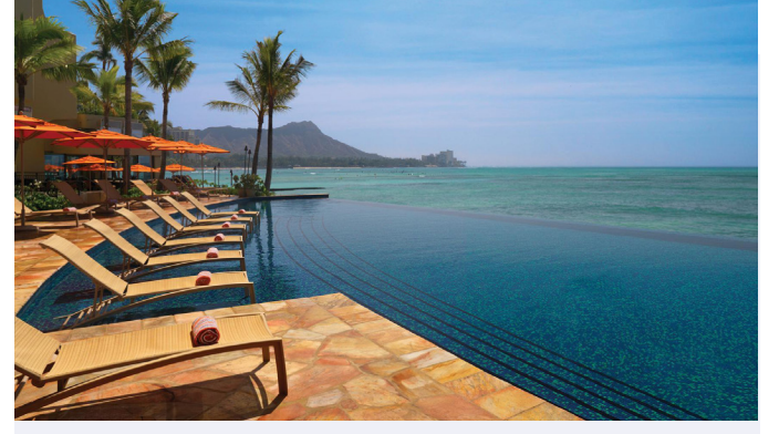
Soak up the warm, Hawaiian sun as you stay in 3 ocean-side resorts: the Sheraton Waikiki, Sheraton Kauai Coconut Beach Resort and Westin Maui.