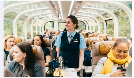
Complimentary Wine & Cheese

All aboard the Rocky Mountaineer Train for the experience of a lifetime on the 'most spectacular train trip in the world!' Experience Rocky Mountaineer's Gold Leaf Service featuring the Bi-level Glass Dome Coach for panoramic viewing, gourmet breakfasts and lunches created by Executive Chefs, morning scones and afternoon wine & cheese, and exclusive outdoor viewing platform revealing a non-stop parade of glorious living postcards!