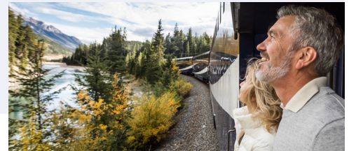
Exclusive Outdoor Viewing Platform

Tunnels, Kicking Horse Canyon and Rogers Pass. Overnight in Kamloops.