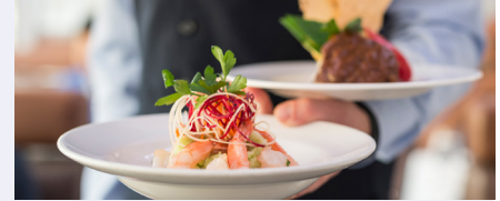
Gourmet Food crafted by Signature Chefs