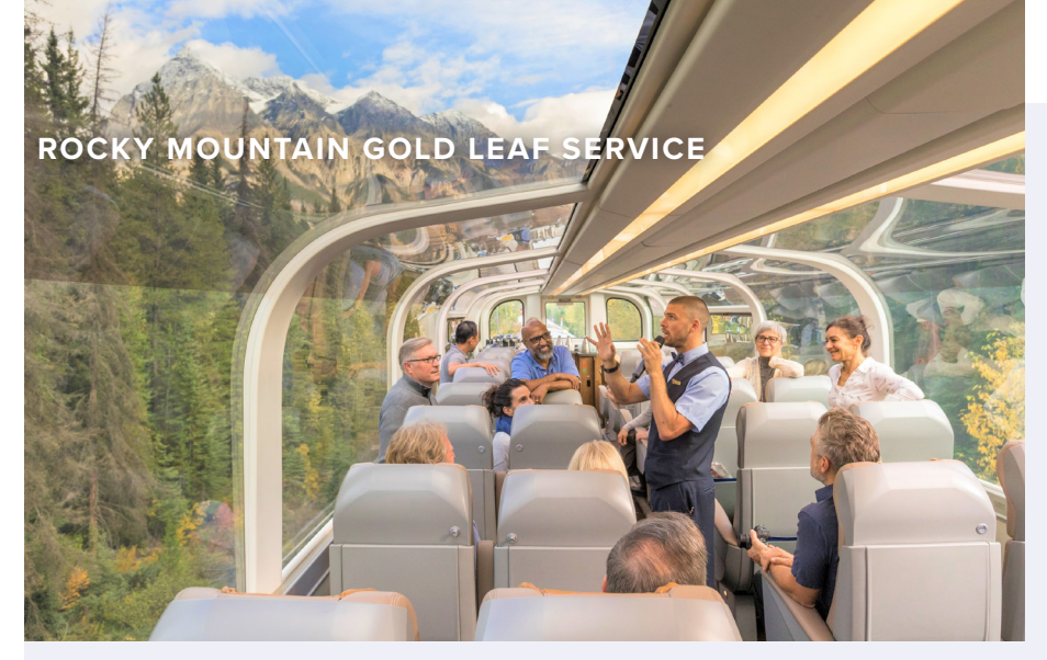
All aboard the Rocky Mountaineer Train for the experience of a lifetime on the 'most spectacular train trip in the world!" Experience Rocky Mountaineer's Gold Leaf Service featuring the Bi-level Glass Dome Coach for panoramic viewing, gourmet breakfasts and lunches created by Executive Chefs, morning scones and afternoon wine & cheese, and exclusive outdoor viewing platform revealing a non-stop parade of glorious living postcards!

Tunnels, Kicking Horse Canyon and Rogers Pass. Overnight in Kamloops.