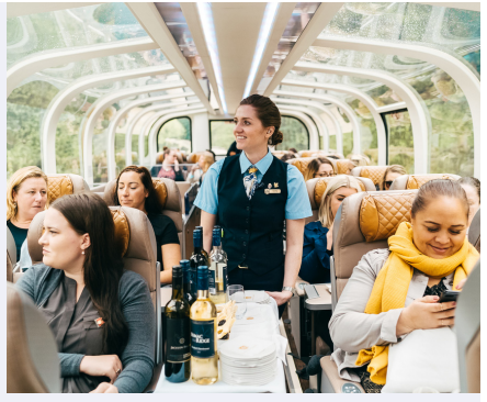
Complimentary Wine & Cheese