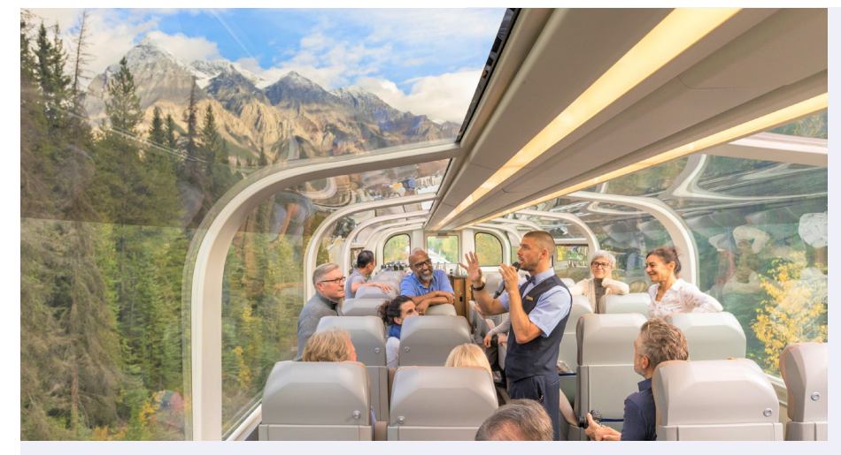
All aboard the Rocky Mountaineer Train for the experience of a lifetime on the 'most spectacular train trip in the world!" Experience Rocky Mountaineer's Gold Leaf Service featuring the Bi-level Glass Dome Coach for panoramic viewing, gourmet breakfasts and lunches created by Executive Chefs, morning scones and afternoon wine & cheese, and exclusive outdoor viewing platform revealing a non-stop parade of glorious living postcards!