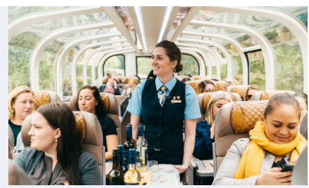
Complimentary Wine & Cheese