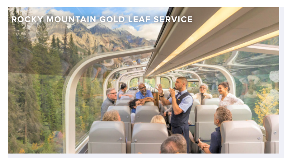
All aboard the Rocky Mountaineer Train for the experience of a lifetime on the 'most spectacular train trip in the world!" Experience Rocky Mountaineer's Gold Leaf Service featuring the Bi-level Glass Dome Coach for panoramic viewing, gourmet breakfasts and lunches created by Executive Chefs, morning scones and afternoon wine & cheese, and exclusive outdoor viewing platform revealing a non-stop parade of glorious living postcards!

Service. Enjoy the spectacular scenery as you travel between the glacier and snow-capped peaks, over mountains and through tunnels. See the Continental Divide, the Spiral Tunnels, Kicking Horse Canyon and Rogers Pass. Overnight in Kamloops.