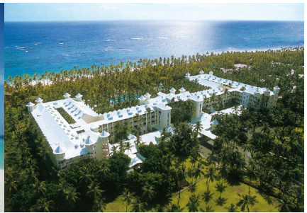
Some of the best beaches in the world can be found in the Dominican Republic. The Riu Palace Macao Hotel (right photo) awaits!

white sand, turquoise waters and coconut palms growing right down to the sea's edge. You'll stay at the all-inclusive Riu Palace Macao, a property that blends into its surroundings with its silky white beach and hundreds of palm trees. All meals, drinks and non-motorized water sports are included as well as air from Chicago, transportation to/from O'Hare and to/from the resort.