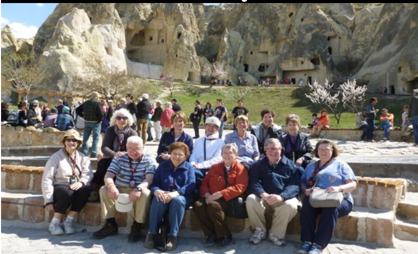
CET travelers to Turkey this March enjoy the Fairy Chimneys found in Cappadocia.