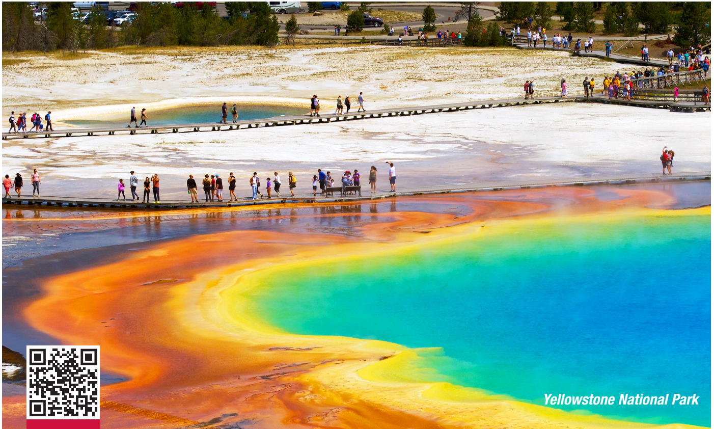
Yellowstone National Park

Offering dozens of trips every year ranging from short half-day jaunts to local tourist hot spots, to exotic multi-week vacations to dream destinations across the world, CET is your partner in making memories of a lifetime. Travelers of all ages are welcome – from young couples and families to empty nesters and seniors, and you don't even have to live in the District 214 service area to travel with us!