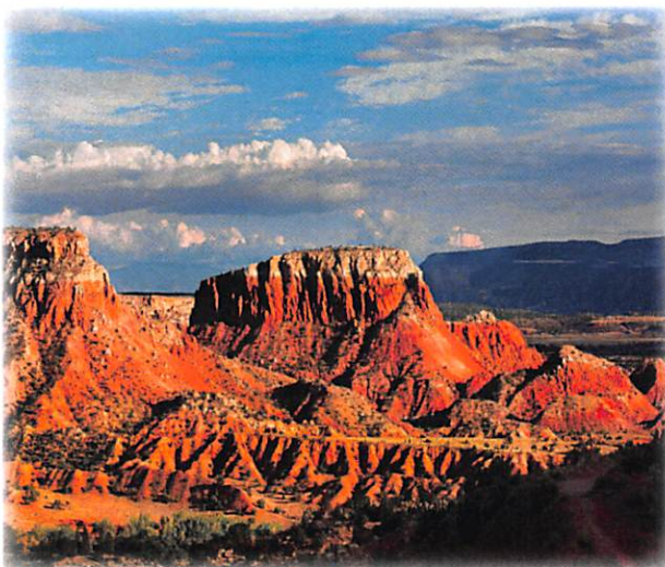
Mountains of New Mexico

Refund policy: Cancels prior to or on 2/1/17 receive a full refund less a $50 per person cancel fee. For cancels after 2/1/17 refunds will be processed through Travel Guard Trip Insurance included in the tour package.