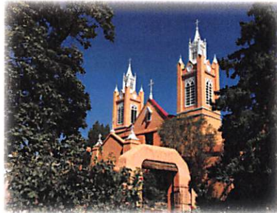
San Felipe de Neri Church