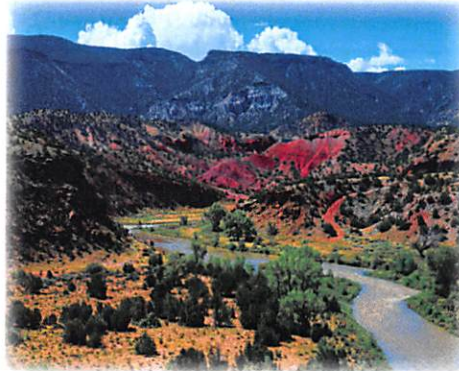
Sangre de Cristo Mountains