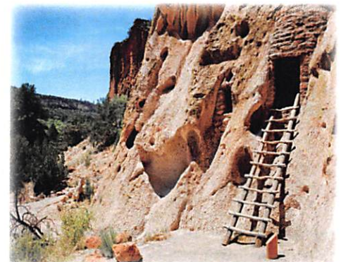
Bandelier National Monument