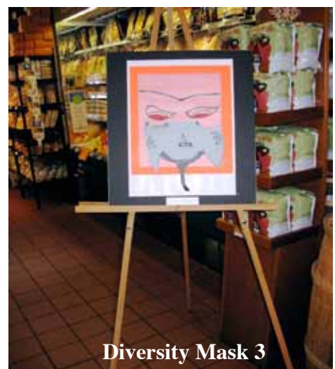
Diversity Mask 3

The Art Exploration curriculum allows KOT campers ages 10 - 13 to create collaborative art projects using sustainable materials under the supervision of artist Larry Crost. Producing the totem poles, drawings, and paintings broadened the children’s environmental awareness, fostered working cooperatively, and promoted expressive communication and socialization skills.